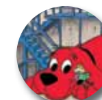
Clifford the Big Red Dog