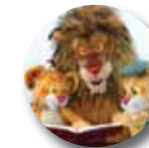
Lionel from Between the Lions