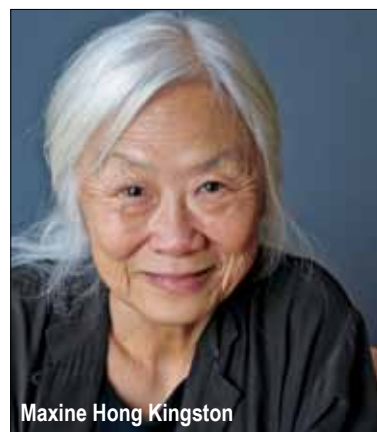
Maxine Hong Kingston