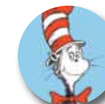
Cat in the Hat